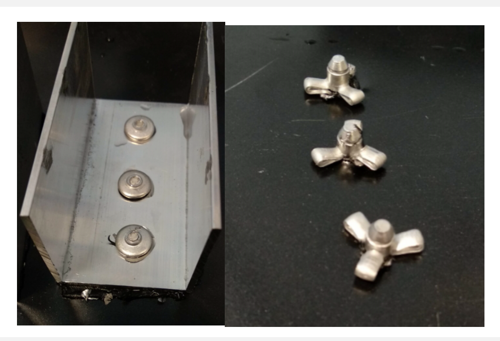
Application example 2: detail showing mounting on sheet metal to test watertightness